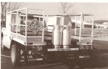
Load on gas cylinders or appliances and raise them to truck bed height—all at the touch of a button.