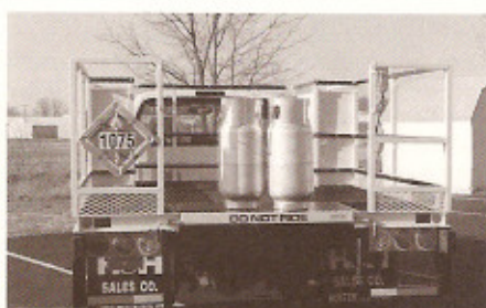
The one-ton truck bed measures only 96" x 121.5" and holds a maximum of forty-three 15" cylinders.