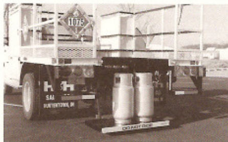
A built-in hydraulic lift platform lowers to street level.